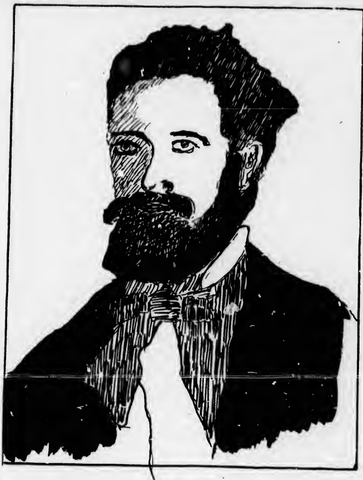
Sandford Fleming, the young Toronto surveyor and draughtsman who designed the first postage stamps used in Canada. This is what he looked like in 1850.

The hand of fate appeared to be guiding the young strangers. When the river steam boat arrived in Montreal they were delighted to meet, of all persons they least expected to see, their old school master from Scotland. He had given up school teaching and had turned his efforts to the ministry. He and his wife were on their way to the north shore of Lake Erie to set up a mission. They invited the two young men to come