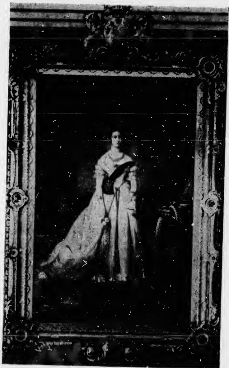
The copy of the Royal portrait in the Council Chamber, City Hall, Toronto.